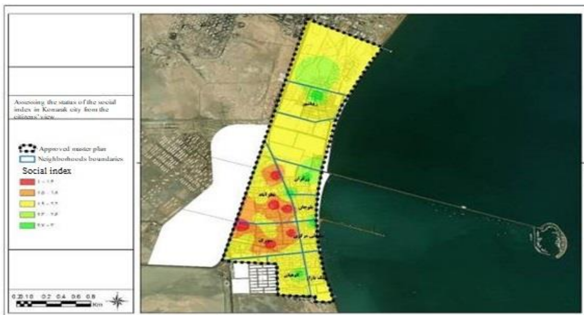
Figure 2. Assessing the status of the social index in Konarak city

The social index examined the following criteria: a) the level of public education on unexpected events and natural hazards such as