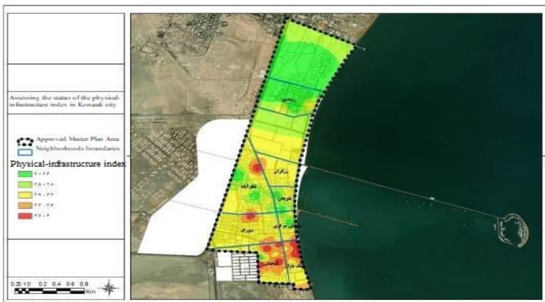
Figure 1. Assessing the status of the physical-infrastructure index in Konarak city

The results show that the neighborhoods of Kohiyan, Kalk Bazaar, Surg and Nazarabad have an unfavorable physical and infrastructure situation, and the neighborhoods of Baluchan and Zibashahr have a more favorable situation. Figure 1 shows the status of the physical-infrastructure index in Konarak city.