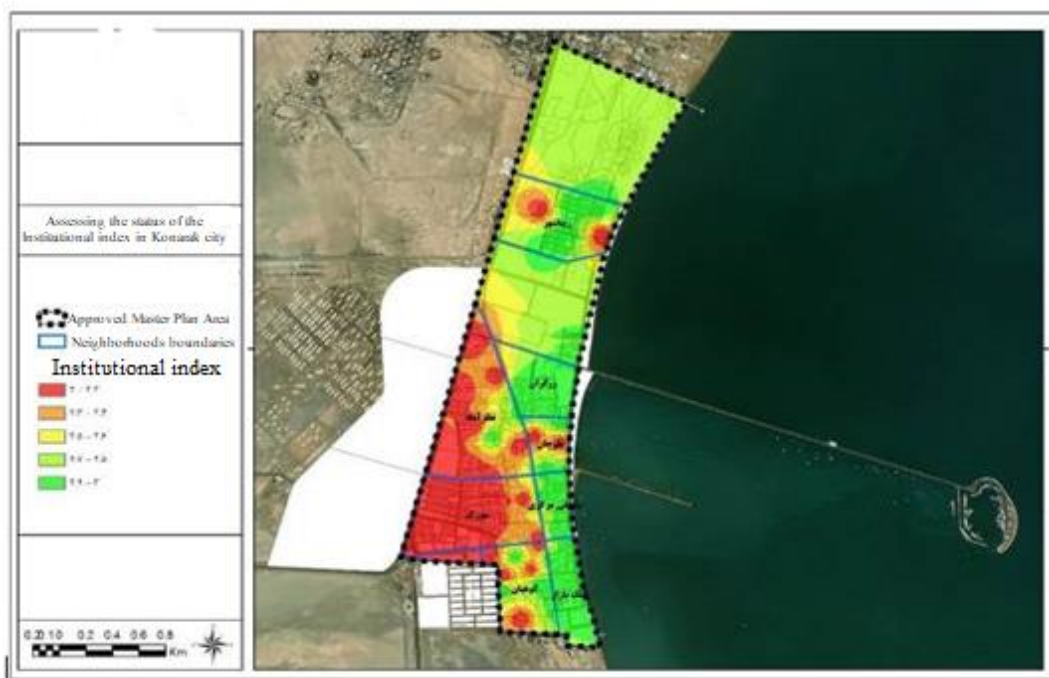
Figure 4. Assessing the status of the institutional index in Konarak city