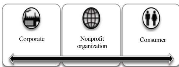
Figure 1. Scope of cause-related marketing (CRM) beneficiaries

societies is known as cause-related marketing (CRM) in which the nonprofit organizations collaborate with the corporations through access to new sources of fundraising and increasing social participation to benefit from the cooperation advantages. The popularity of this marketing tool is nowadays evident in the level of the involvement of corporates in social causes as it grew by 3.6% in the United States in 2017 and a total of 2.06 billion dollars has been dedicated for it (2). The term CRM was first coined in the 1980s and refers to campaigns where a corporate works with a nonprofit organization to help a particular social cause, whether through product sales or product use (3). In fact, CRM is a marketing tool that can be used to achieve a wide range of goals (4). Numerous studies have indicated that the emergence of CRM has increased the scope and breadth of the organization's beneficiaries beyond consumers and by integrating it with the nonprofit sectors (Figure 1), especially the sectors with knowledge and progress dealing with the social field for the improvement of social causes, such as human rights or sustainable development (5).