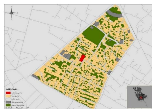
Figure 8. Locating restored building (authors)