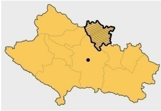
Figure 1. Geographical location of Borujerd city in Lorestan province