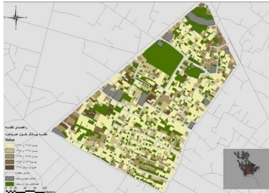
Figure 11. Longevity of the buildings (authors)