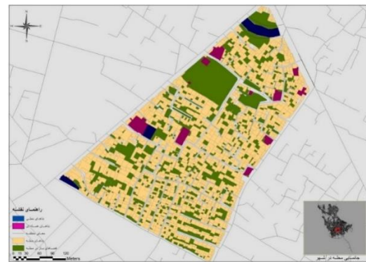
Figure 6. Locating various forms of public buildings (authors)

horizontal dimensions and those that cannot tolerate the pass correction are considered geometrically irregular.) or that were problematic due to the corrections made after reconstruction processes, such as widening the carriageways. The second group consisted of small buildings, and consequently, of high vulnerability. Lack of geometric regularity and the smaller size (buildings with an area of lesser than 50 square meters including business and residential uses. See the table of extracted indexes.) of the building showed a complex seismic behavior that was much harder to be analyzed and predicted, compared to regular and simple buildings, which resulted in its higher vulnerability. On the other hand, these buildings confront the officials with greater difficulties (Due to the irregular structure which is in contrast with the regular structure of the reconstructed area and buildings, this issue causes an increase in the costs of the reconstruction process.) during the reconstruction process and cause a delay in reconstruction and a waste of resources.