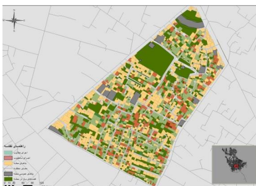
Figure 7. Locating of poorly constructed buildings (authors)

vulnerable during and after the earthquake and their reconstruction underwent greater delay. Figure 2 shows the percentage and number of irregular and unconventional buildings and categorizes the blocks based on this index. According to this figure, blocks number 13 and 1, with the highest frequency of more than 90% of the buildings, had the highest vulnerability. Among 109 buildings in block No. 1, 105 buildings were found asymmetric and unconventional and all the 4 buildings in block No. 13 were also asymmetric and irregular. Following that, blocks number 15, 10, 4, 3, and 2, had a great vulnerability with more than 80% of the irregular buildings, compared to all buildings in this neighborhood. In other words, block No. 2 with 137 buildings out of 171 buildings, block No. 3, with 4 buildings out of the total of 5, block No. 4 with 146 buildings out of 181, block No. 10 with 198 buildings out of 223, and block No. 15 with 11 buildings out of 13 were within this range of vulnerability. Block 12 with 70%, block 8 with 60%, block 6 with 56%, block 9 with 55%, block 5 with 45%, block 7 with 43%, and block 11 with