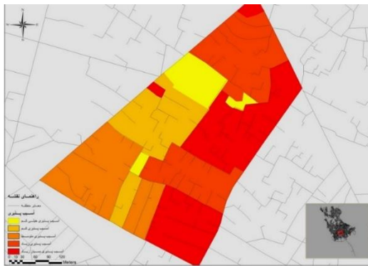
Figure 5. Location of blocks with irregular and unconventional buildings (authors)