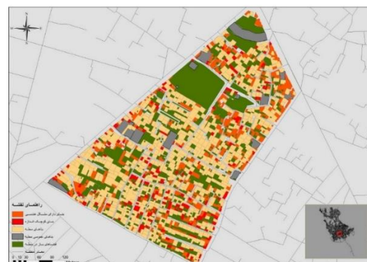
Figure 4. Locating buildings with geometric problems (authors)

The assessment of these buildings was based on three maps, namely the existence of asymmetries in the plot plan, the frequency of asymmetries in the block, and different forms of public buildings. Figure 1 depicts two types of buildings which were found in great numbers in this neighborhood. One group was the buildings with severe inherent geometric problem (According to the index explanations, the buildings which have irregular vertical and