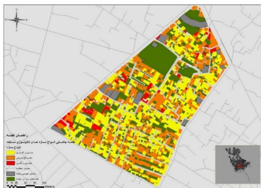
Figure 9. Types of construction and technology (authors)