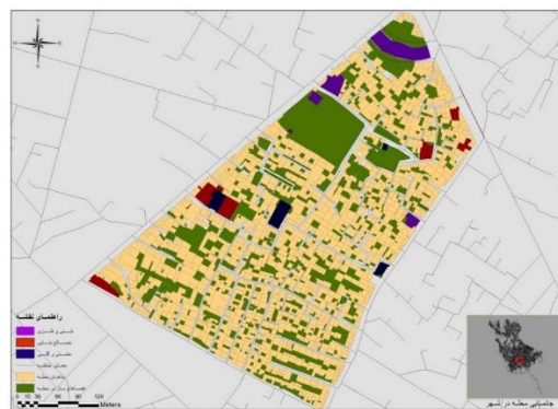
Figure 10. Locating types of construction technology (authors)

30% of irregular and geometrically problematic buildings (respectively, 108 out of 154, 21 out of 35, 31 out of 156, 23 out of 42, 67 out of 149, 16 out of 37, and 3 out of 10) formed the next ranks of highly vulnerable buildings. Block 14, which was the green space, was analyzed as having the lowest rate of vulnerability in this index. Totally, out of 1,290 buildings in this neighborhood, 874 (68%) buildings had geometric asymmetries. This amount, which formed one-fifth of the whole number of buildings in this neighborhood, indicated that with a score of 4.5, the vulnerability was very high. Since different forms of public buildings perform different functions in different periods, it is important to investigate them from this point of view. According to Figure 4, 80% and 20% of public buildings have nuclear and linear forms, respectively. Although linear forms were more vulnerable during the earthquake, since the number of such buildings was less in the neighborhood, the rate of vulnerability decreased. Therefore, according to the abovementioned issue and the greater number of nuclear buildings, the vulnerability number of 3.2 can be considered as an average indicator.