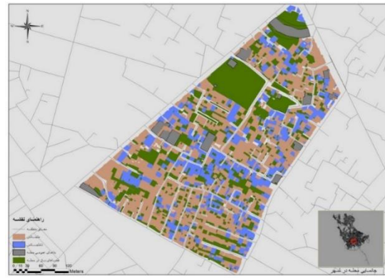
Figure 12. Locating incompatible buildings (authors)

Different factors can cause this incompatibility, including the excessive worn out status of the buildings and breakdowns, extra height compared to the vicinity, large size, and formal contradictions. This amount of incompatible buildings and the way that they are spread throughout the area indicate a high vulnerability index reflected by the vulnerability number of 4.