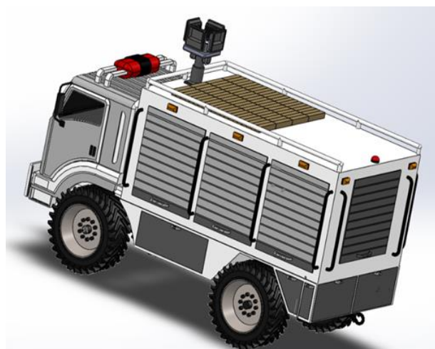
Figure 2. Appearance / overall survival vehicle