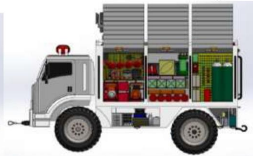
Figure 5. Various items and equipment embedded in auto parts survival