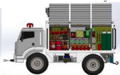
Figure 5. Various items and equipment embedded in auto parts survival