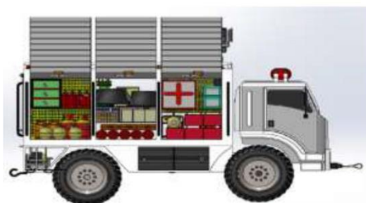
Figure 4. Various items and equipment embedded in auto parts survival

The aforementioned items are displayed in figures 4-7.