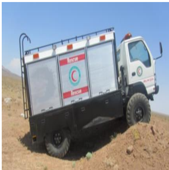
Figure 1. Appearance / overall survival vehicle