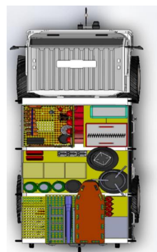
Figure 7. Various items and equipment embedded in auto parts survival