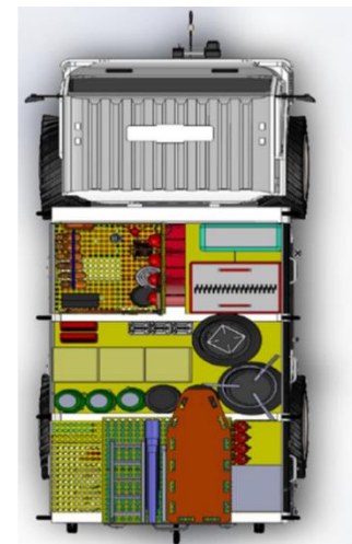
Figure 7. Various items and equipment embedded in auto parts survival