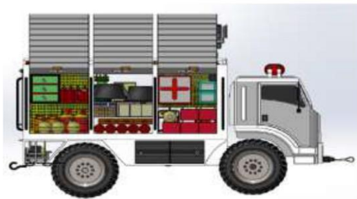
Figure 4. Various items and equipment embedded in auto parts survival

The aforementioned items are displayed in figures 4-7.