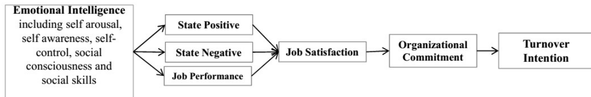
Figure 1. Conceptual model taken from the research (13)

The proposed conceptual model (Figure 1) depicts the relationship between emotional intelligence and organizational commitment, turnover intention, job performance and job satisfaction. Also, according to the proposed research plan, variables of job performance and emotions (state positive affect and state negative affect) can also mediate the relationship between emotional intelligence and job satisfaction.