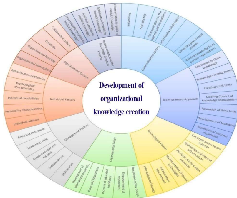
Figure 2. Organizational knowledge creation pattern in military nursing education resulting from meta-synthesis

and international level, academic travel, and networking); 6) organizational policy (development of the appropriate financial platform, laws and regulations, increase in educated workforce, and empowerment of researchers and responsive policy design); 7) implementation of knowledge creation process (externalization (implicit to explicit knowledge), socialization (implicit to implicit knowledge), combination (explicit to explicit knowledge), and internalization (explicit to implicit knowledge); 8) organizational culture (collaborative culture, creativity, organizational learning and organizational atmosphere) (Figure 2).