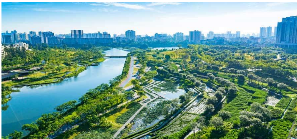
Fig 3. Green space in the sponge city