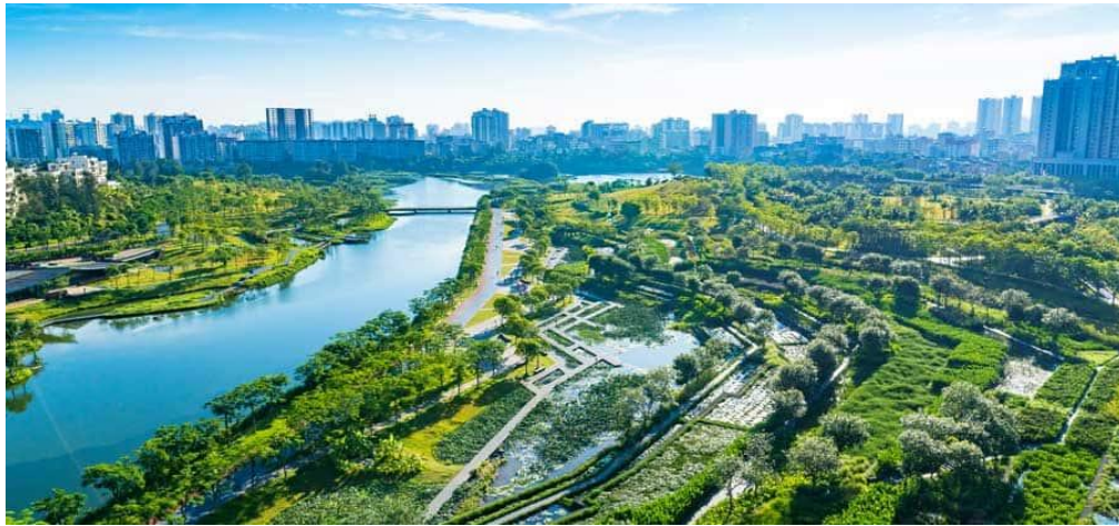
Fig 3. Green space in the sponge city