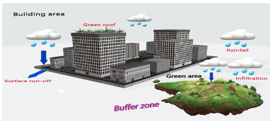
Fig 2. Sponge city model

6) Programs for water recycling and savings . Systems are planned aiming to maximize water savings; they depend on the amount required for storage and the availability of space to store.