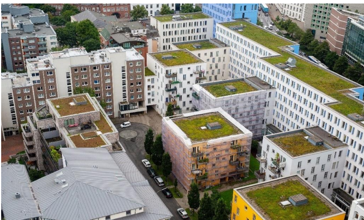
Fig 4. Design of buildings in sponge city